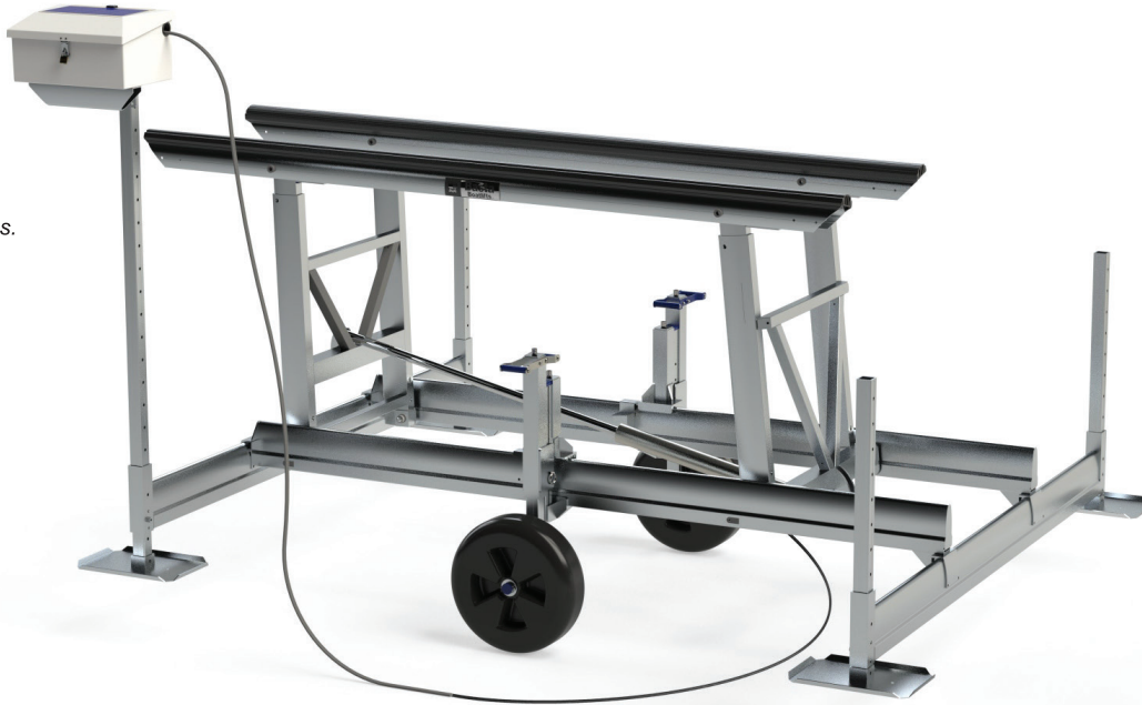
Typical lift shown with optional features.

Jack height and jaw opening can be adjusted with a 1/2" drive ratchet. Do not use an impact wrench - it may damage the mechanism.