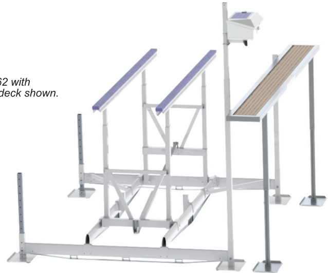
Lift model 6k62 with optional side deck shown.

Long lift legs and white power unit box as shown are not included in kit.